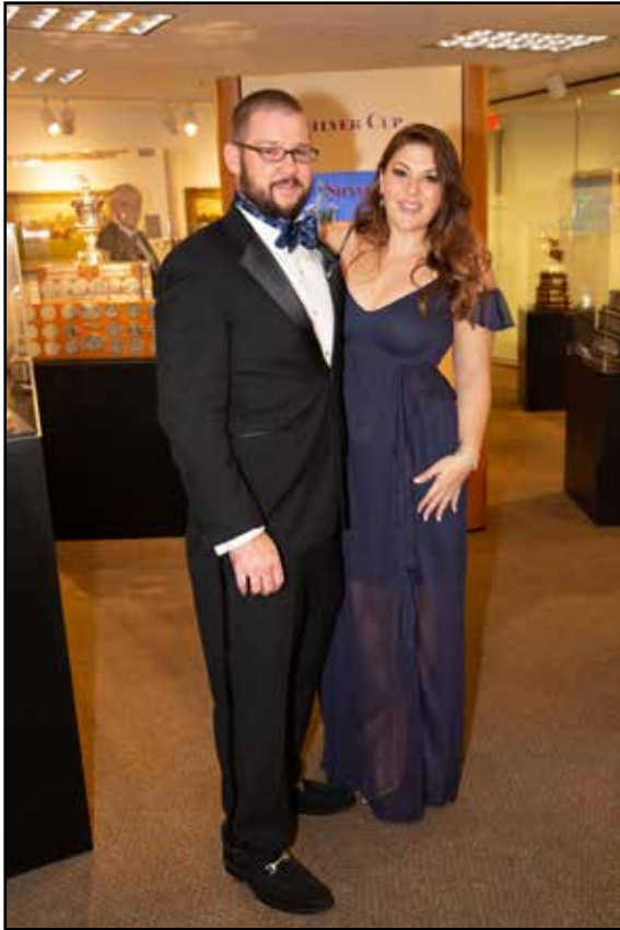
NEW AT THE MUSEUM