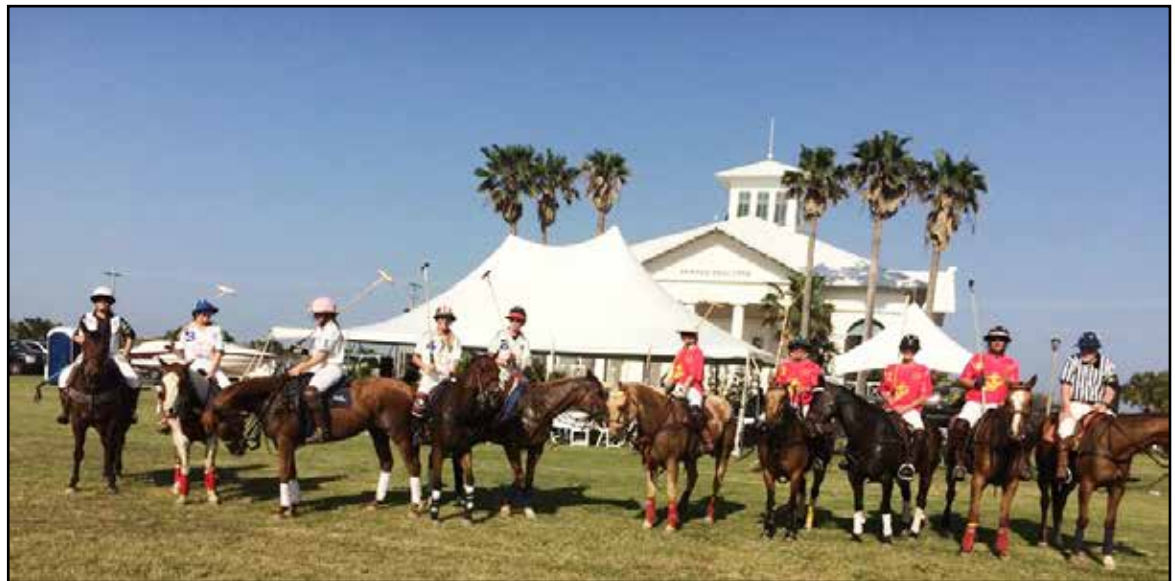
Photo of winning team CTPA was not available. The above photo of CTPA team in red shirts on right is from prior week's match.